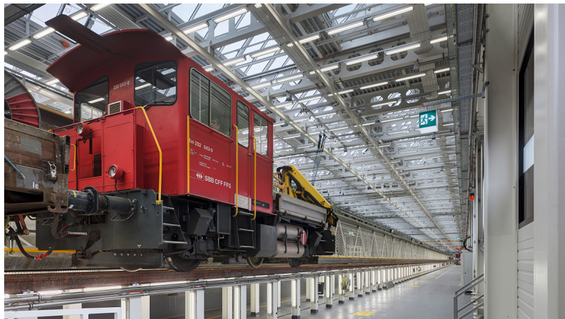
Interior view Herdern Train Maintenance Depot