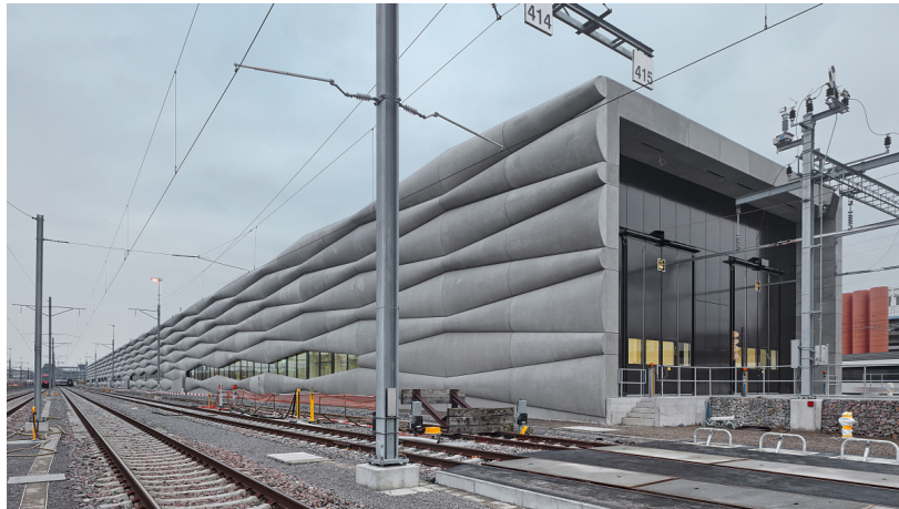
Exterior view Herdern Train Maintenance Depot