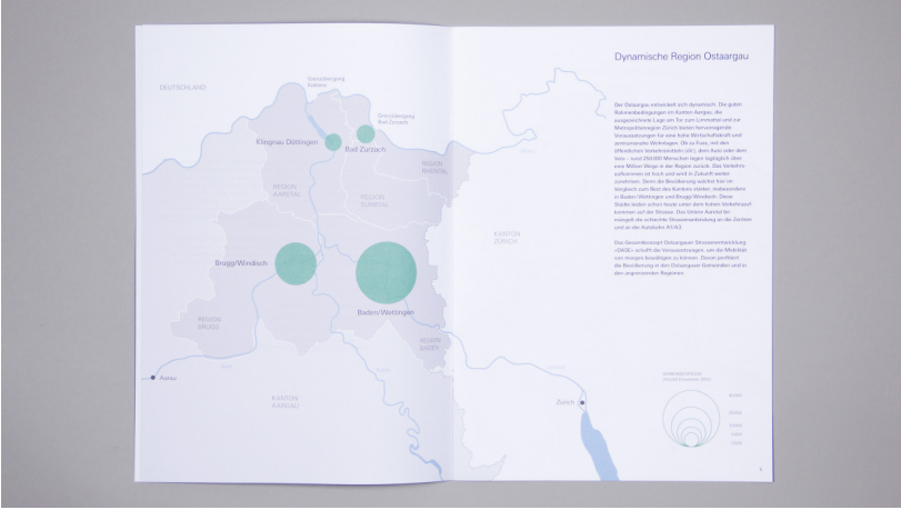
Infographic: Population statistics for municipalities in Ostaargau

access to public transportation in city and town centers, and improvements in the available infrastructure for pedestrians and bicyclists. All of the measures have also been designed to account for railway development plans and other spatial development goals.