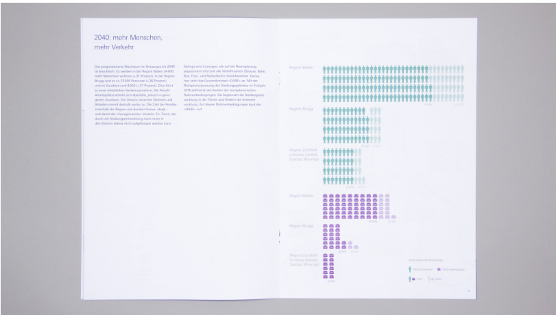
Infographic: Forecast of settlement development