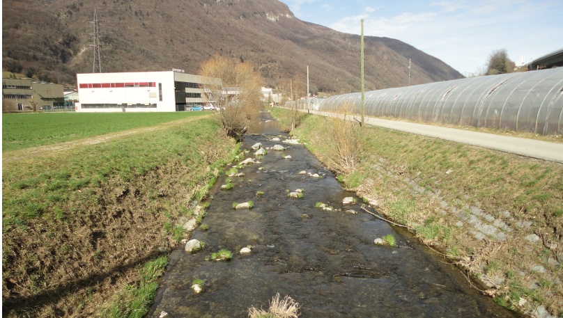
View in direction of River Laveggio close to the sewage treatment plant

While all of the many stakeholders agree that the Laveggio's current state is unacceptable, their proposals for its development and use diverge. Conflicts relating to the river's future therefore seem unavoidable.