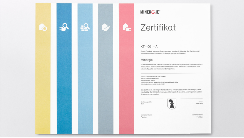
Certificates with a new look