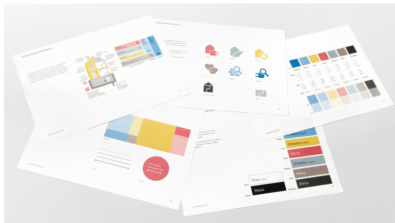
Development of corporate identity and corporate design

In the context of completing a comprehensive relaunch of the Minergie brand, EBP provided a wide range of communication services, including brand analysis, ideation, client consultation and project implementation. The result is a corporate look with a high degree of brand recognition and user-friendly design.