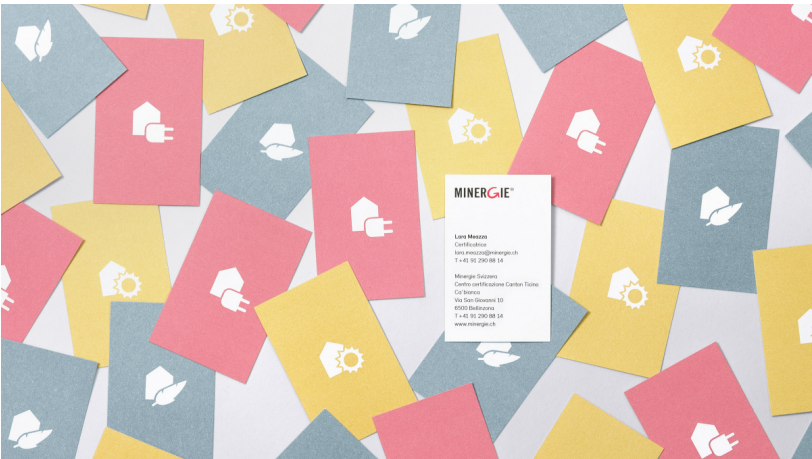
Stationery with a new look