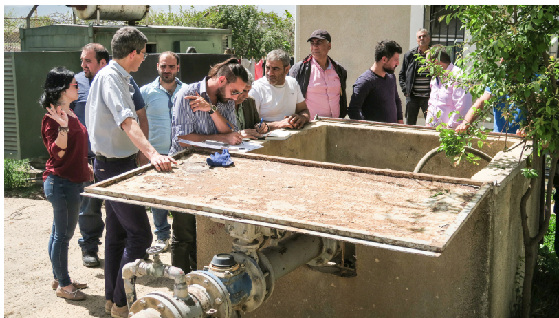
Well pumping site appraisal near Shtoura

In the course of this mandate, we initiated and supported a pioneering application of the AquaRating methodology in the Middle East and North African Region - an internationally developed methodology for transforming the management of water and sanitation utilities.