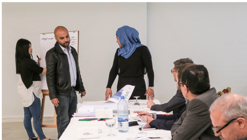
Business processes analysis workshop