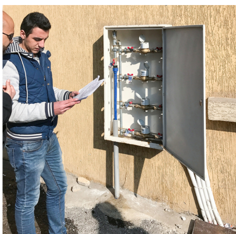
Water meter reading in Zahlé