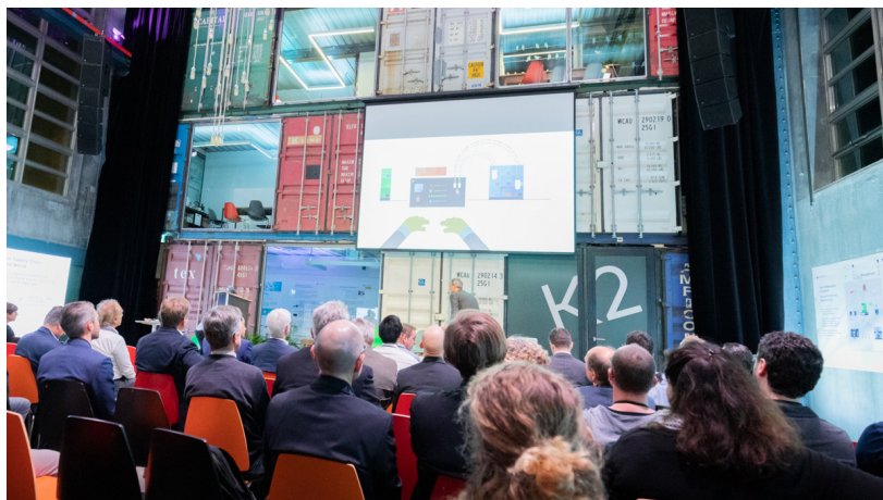
Poster installation at MODday 2019