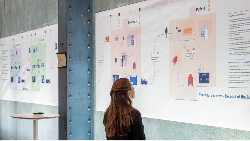
Poster installation at MODday 2019