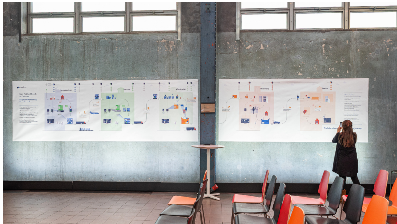
Poster installation at MODday 2019