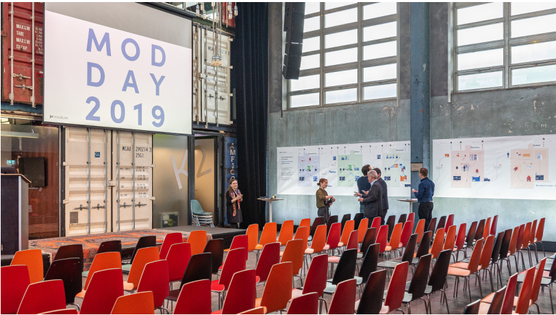
Poster installation at MODday 2019