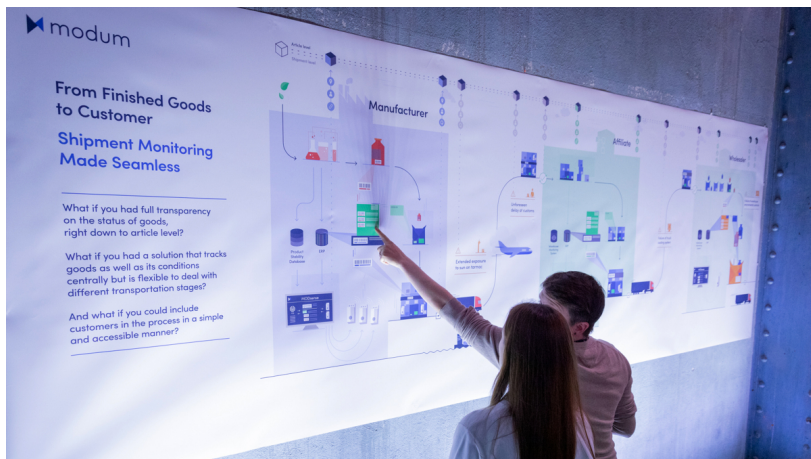
Poster installation at MODday 2019