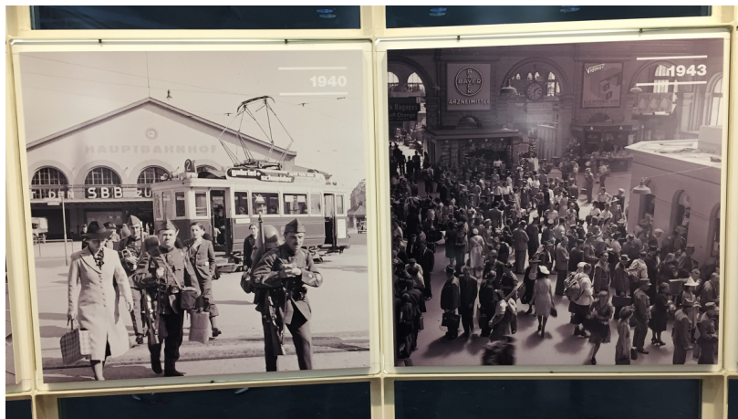
The Bern train station around 80 years ago