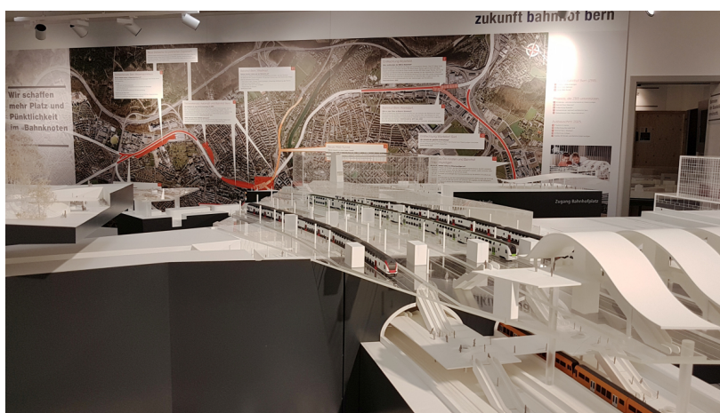
Showroom presentation of a model of the new train station