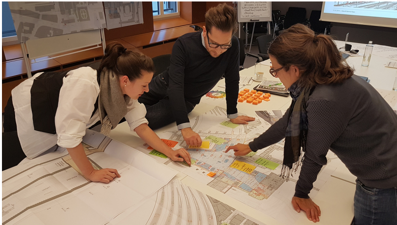
Internal workshop at EBP with our urban-psychology team