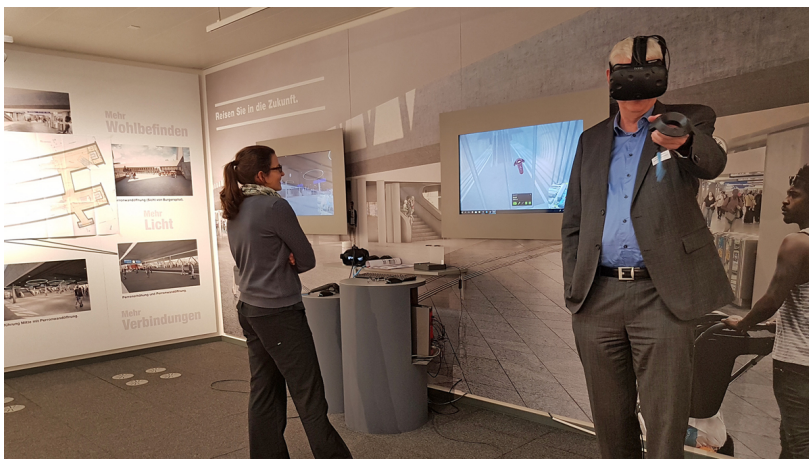
Virtual walk-through of the new train station in our showroom