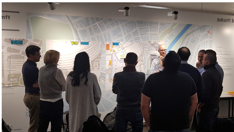
Discussions of daytime and nighttime security moderated by EBP, including workshops