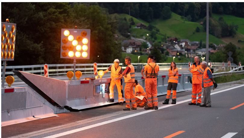
Photography capturing the various renovation measures