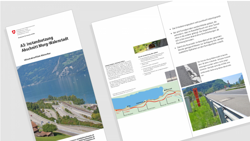
Flyer offering the most important project information