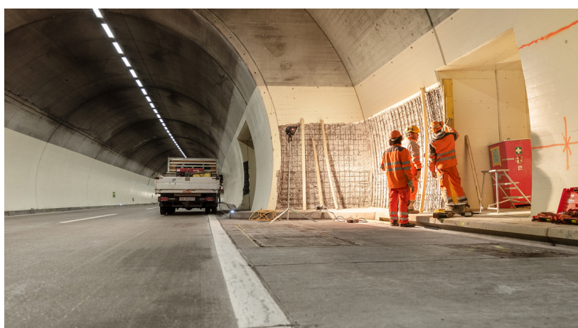
Photography capturing the various renovation measures