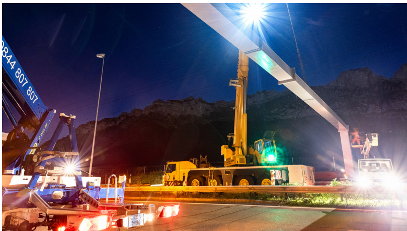
Photography capturing the various renovation measures