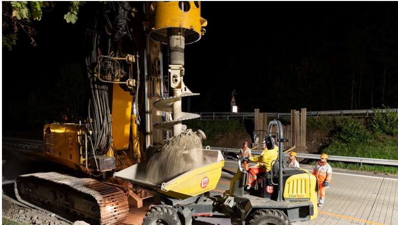
Photography capturing the various renovation measures