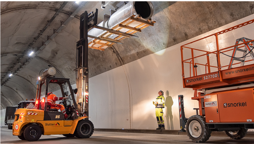
Photography capturing the various renovation measures