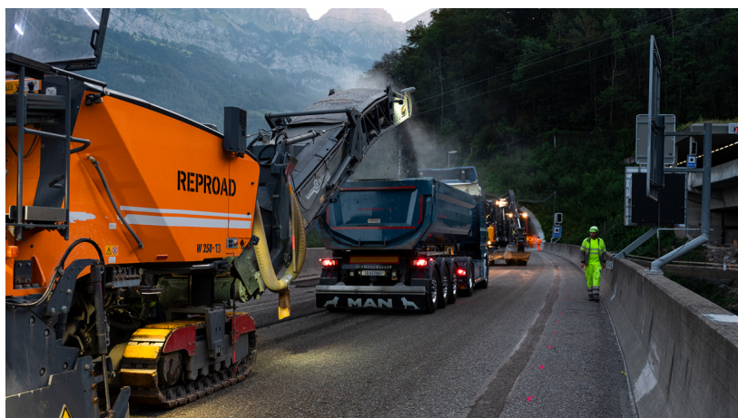
Photography capturing the various renovation measures