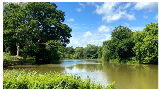
Bodies of water and trees with large crowns have a moderating effect on local climates