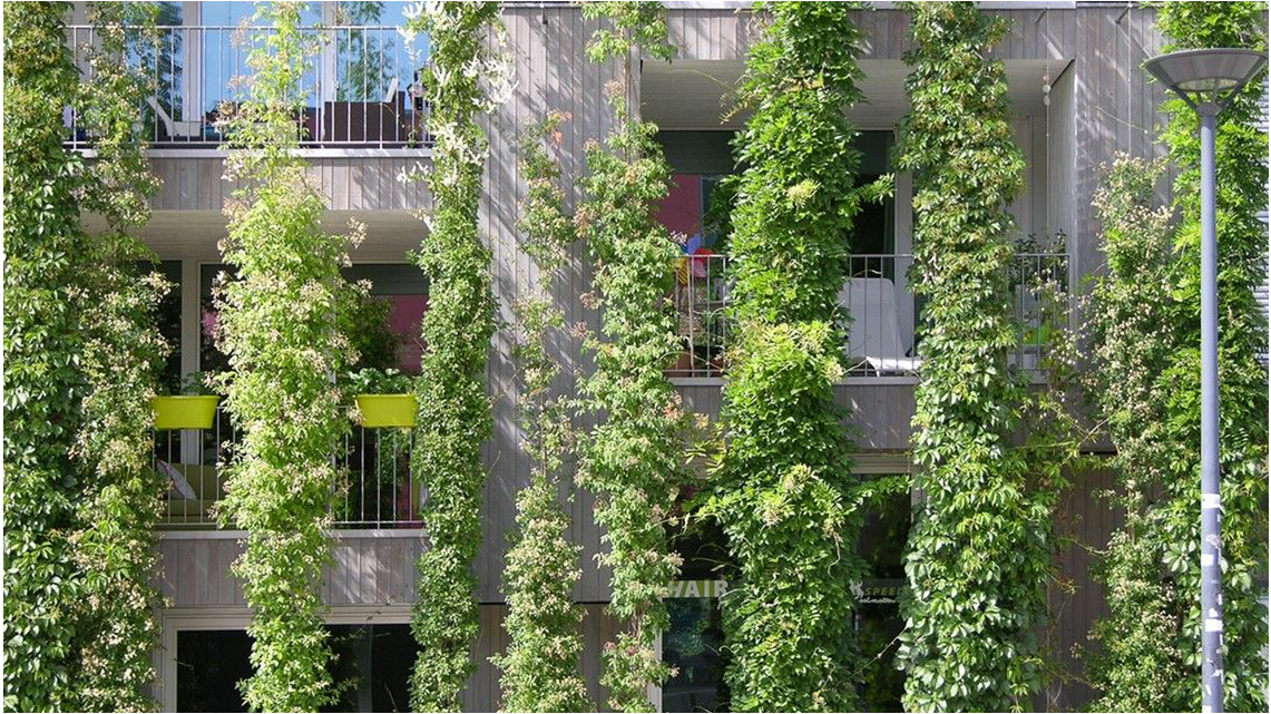
Façade greening cools via shading and evaporation