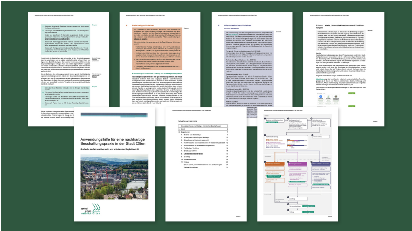
Pages from the guidance on sustainable procurement in the City of Olten