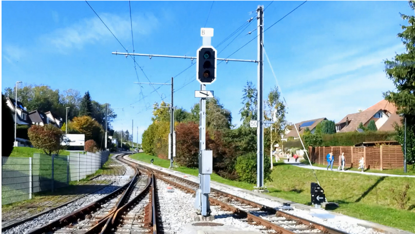
Forchbahn AG video excerpt: departure from Esslingen Railway Station