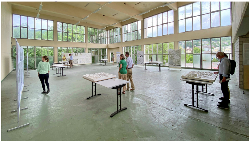
On-site exhibition of the development proposals