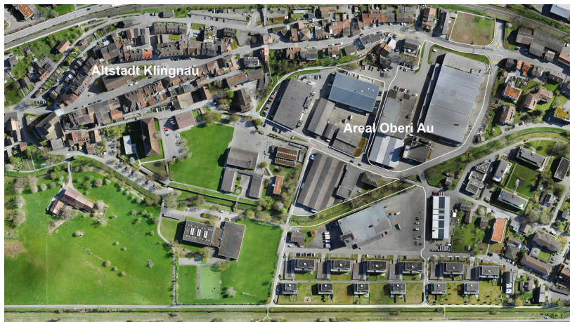
Orthophoto of Klingnau's oldtown and the Oberi Au site