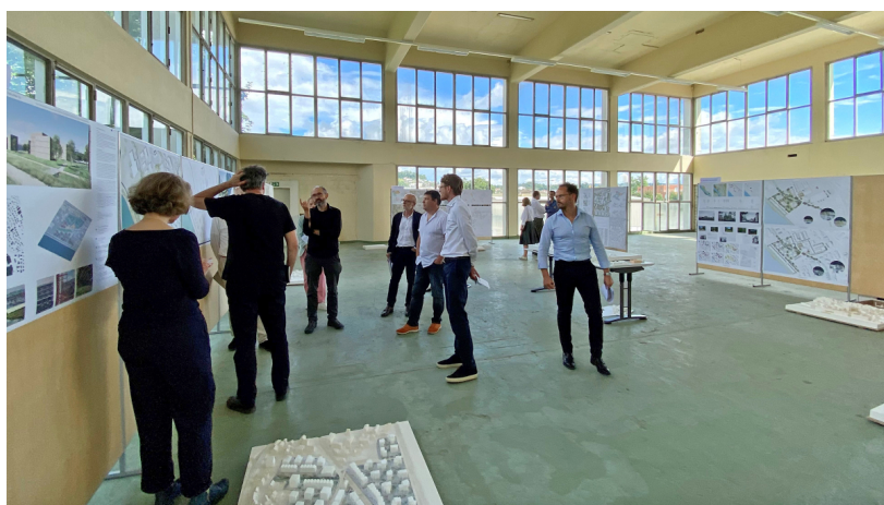
The jury deliberations at the development site