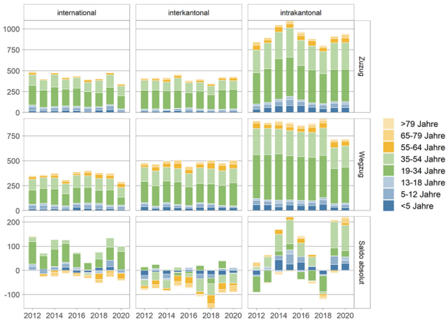
Migration by age group and type of migration: Immigration from/to foreign countries is dominated by younger age groups. Sources: STATPOP, BFS