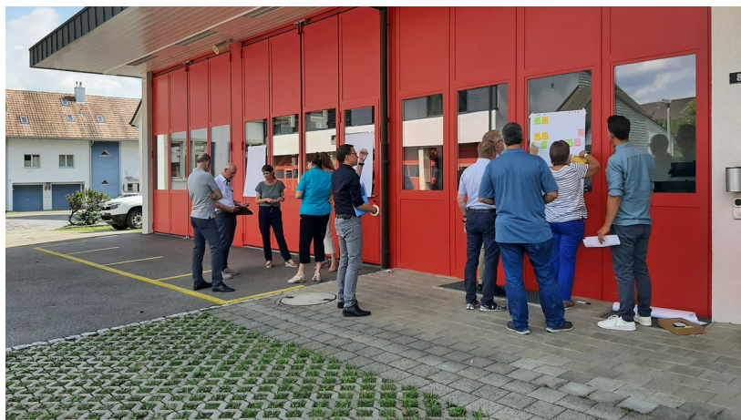
Preparatory workshop in the runup to the municipal assembly