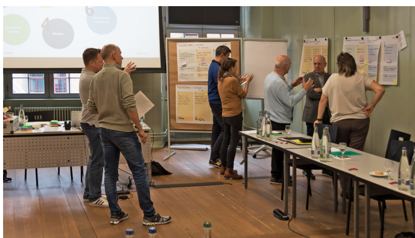
Bubikon municipal assembly