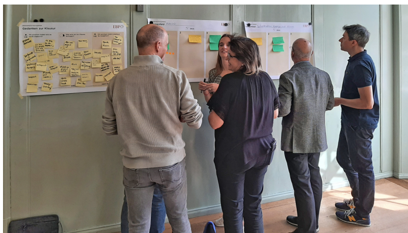
Bubikon municipal assembly