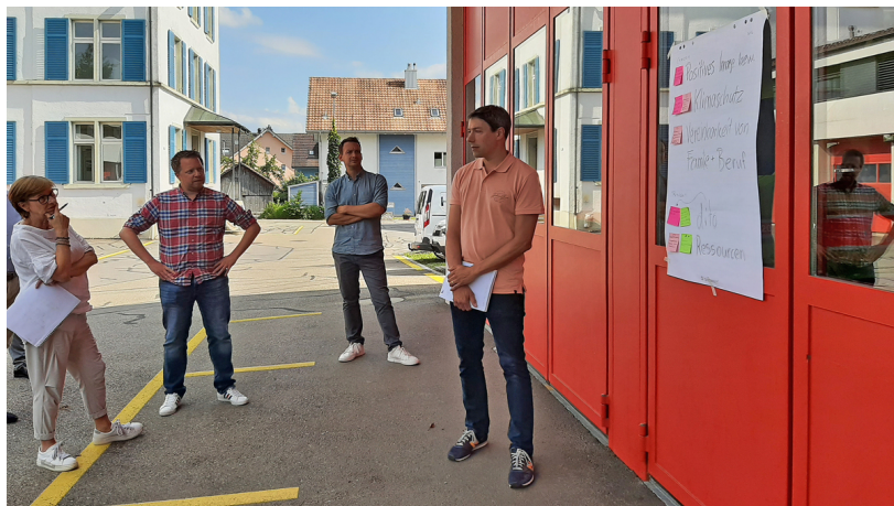
Presentation of risks and opportunities