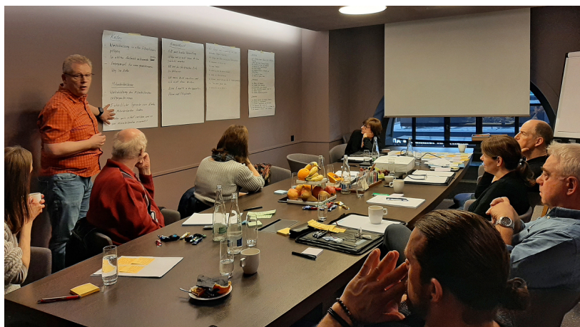
Collaboration culture workshop