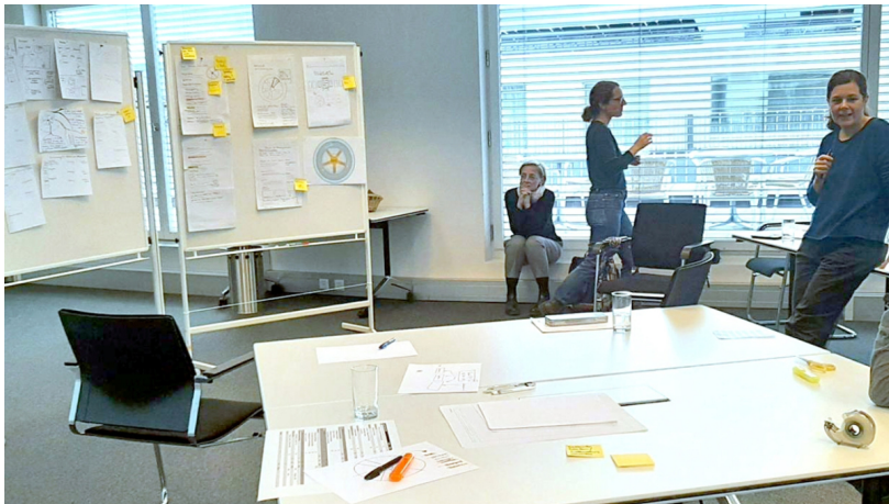
Prioritization of solutions in the workshop and selection of a basic design for the prototype