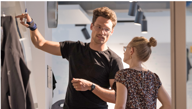
BIM seed development process at the EBP BoostCamp