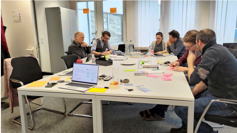
BIM seed training with executives and specialists of Appenzell Railways