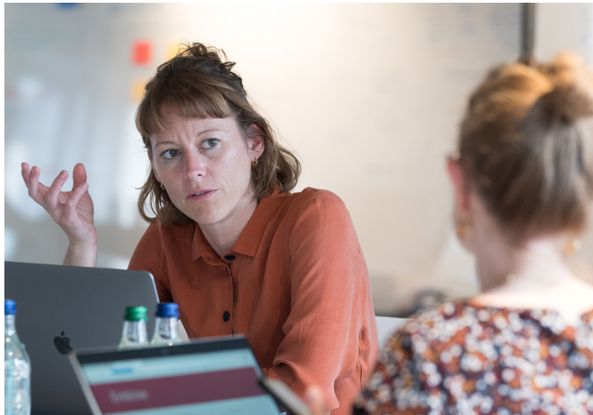
BIM seed development process at the EBP BoostCamp