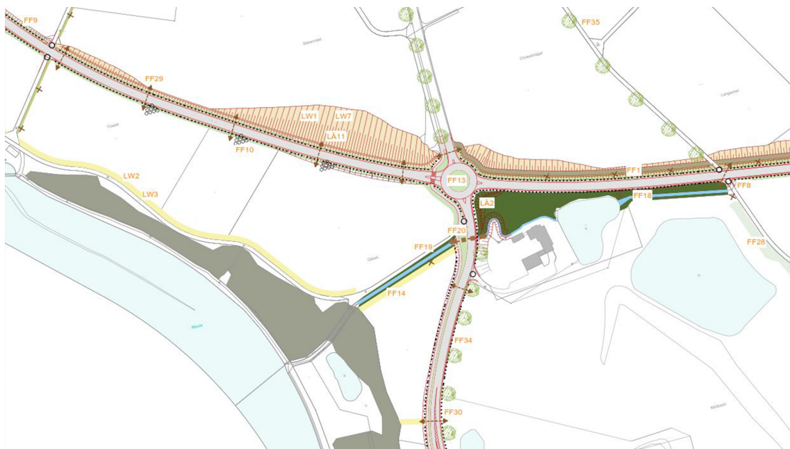
Extract of the landscape preservation plan for the Obfelden/Ottenbach bypass

Landscapes and local architecture are constantly changing - but drastic changes are often only evident over time. Which makes it even more important to carefully plan how to integrate new elements into the existing landscape. We assess the impact of construction projects on landscapes and heritage sites, and plan measures for according solutions.