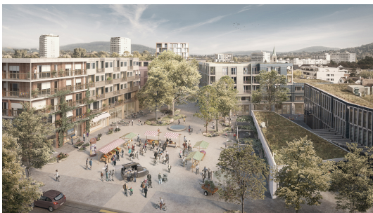
Evaluation of land-lease developers for 13 plots in the municipality of Birsfelden (visualization: central plaza, new Birsfelden town center, October 2021 © Harry Guggler Studio, Basel | Westpol Landscape Architecture, Basel | Visualization: Nightnurse Images, Zurich)