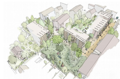
Evaluation of land-lease developers for four plots at the “Hardstrasse” site in Birsfelden (Design Concept, © 2019 Salewski & Kretz Architects, Zurich)