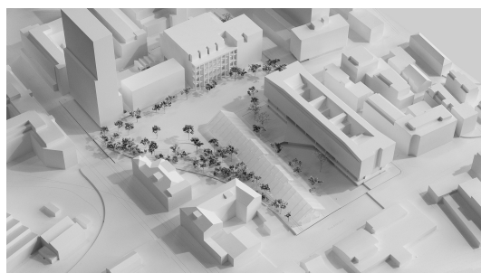
Koch development site: coordination of developer